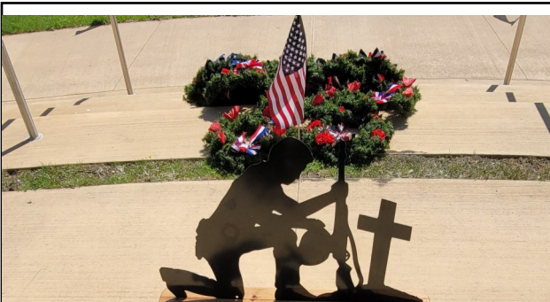
Memorial Day 2023 Riverfront Memorial Park Anoka

To help Post #102 save money on postage, please send your new email address to http://www.anokalegion.org/ .