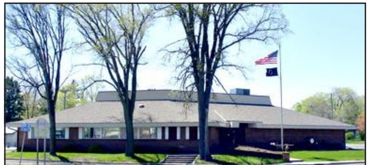
Edward B. Cutter Post 102 – 400 W. Main St., Anoka, MN 55303 • 763-421-0883 www.anokalegion.org

GOVERNMENT CENTER Room 233 2100 3rd Avenue Anoka, MN 55303-2265