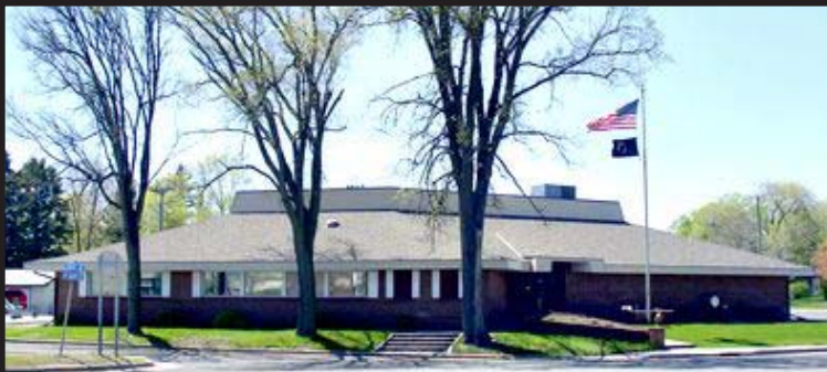
Edward B. Cutter Post 102 - 400 W. Main St., Anoka, MN 55303 • 763-421-0883 www.anokalegion.org