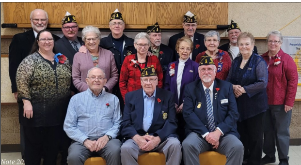
American Legion Birthday Dinner March 2023

To help Post #102 save money on postage, please send your new email address to http://www.anokalegion.org/ .